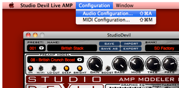
Studio Devil Virtual Bass Amp – User's Guide, Page 9 of 11